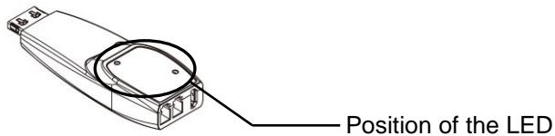
Figure 2 – Position of the LED

Power LED will turn on when HDFX-350-TR is connected to HDMI signal source and display and Status LED will blink three (3) times. Then Status LED will blink again when the whole connection is made.