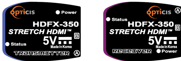
Figure 3 – HDFX-350 product label

Connect two (2) LC multimode fibers between the transmitter and the receiver and each fiber channel shall be connected as (A) to (A) and (B) to (B) carefully. Ensure the duplex connectors are fully engaged and then, Status LED will begin to blink regularly.